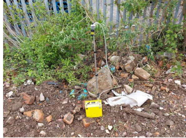
2. Sample 2, Scott Pallets