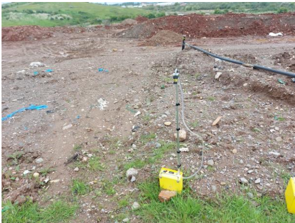
3. Sample 3, cell 3