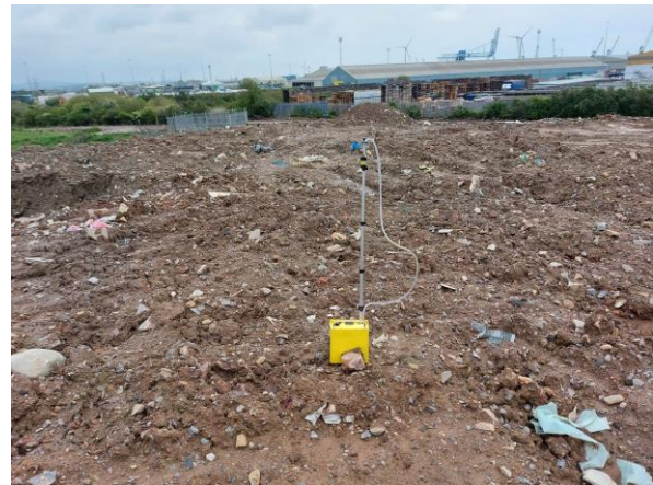
4. Sample 4, asbestos clay bund