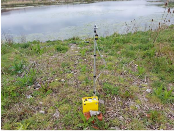
1. Sample 1, lagoon