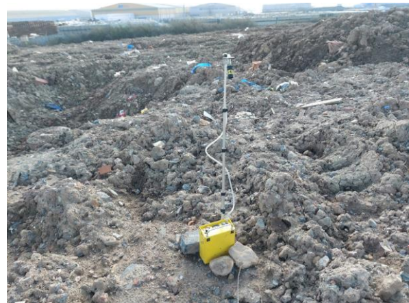
4. Sample 4, asbestos clay bund