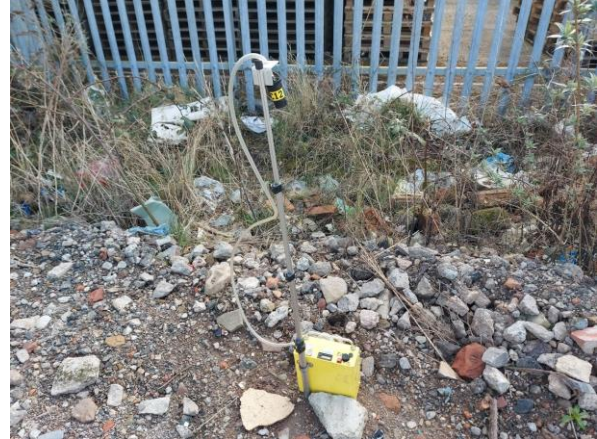
2. Sample 2, Scott Pallets