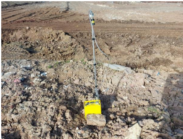
3. Sample 3, cell 5 ridge