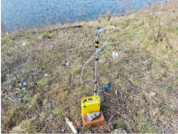
1. Sample 1, lagoon