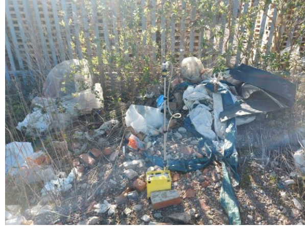
2. Sample 2, Scott Pallets