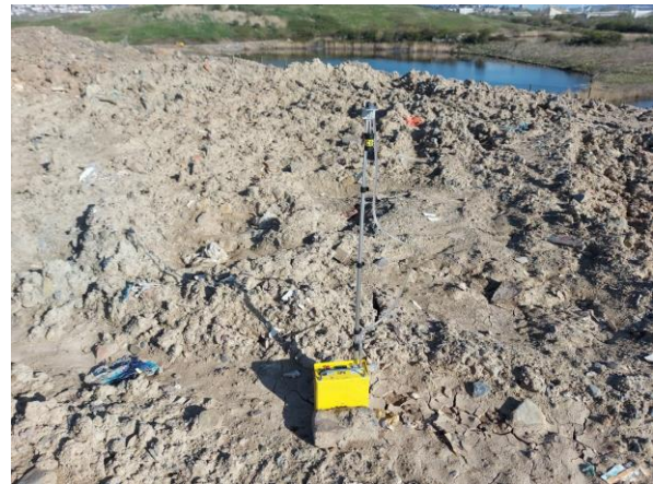
4. Sample 4, asbestos clay bund