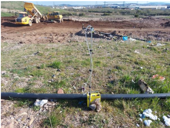
3. Sample 3, cell 3