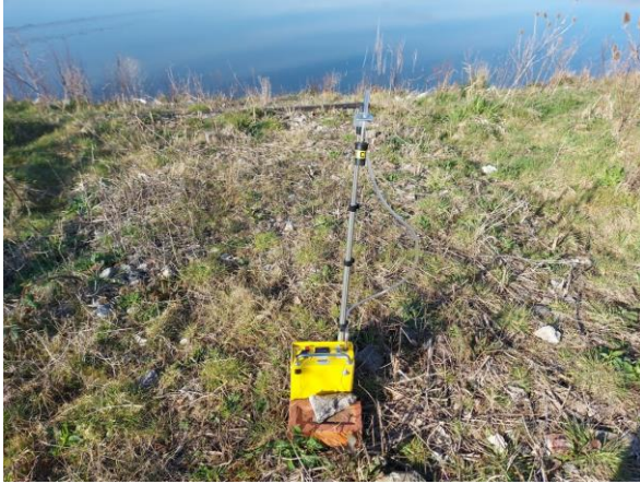
1. Sample 1, lagoon