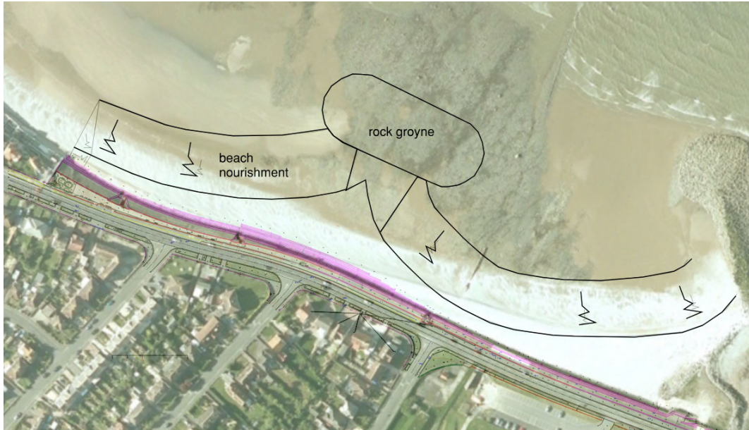
Figure 1b – Plan of Proposed Works (Low Tide).

A limited degree of flexibility exists in the location of the rock groyne to achieve the requisite design parameters and project objectives. The baseline data presented within this report will inform potential intertidal biodiversity constraints that may facilitate micro-siting of the proposed coastal defences.