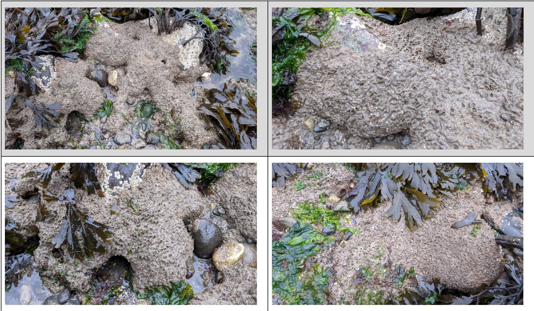
Figure 3: Eroded Sabellaria alveolata aggregations.