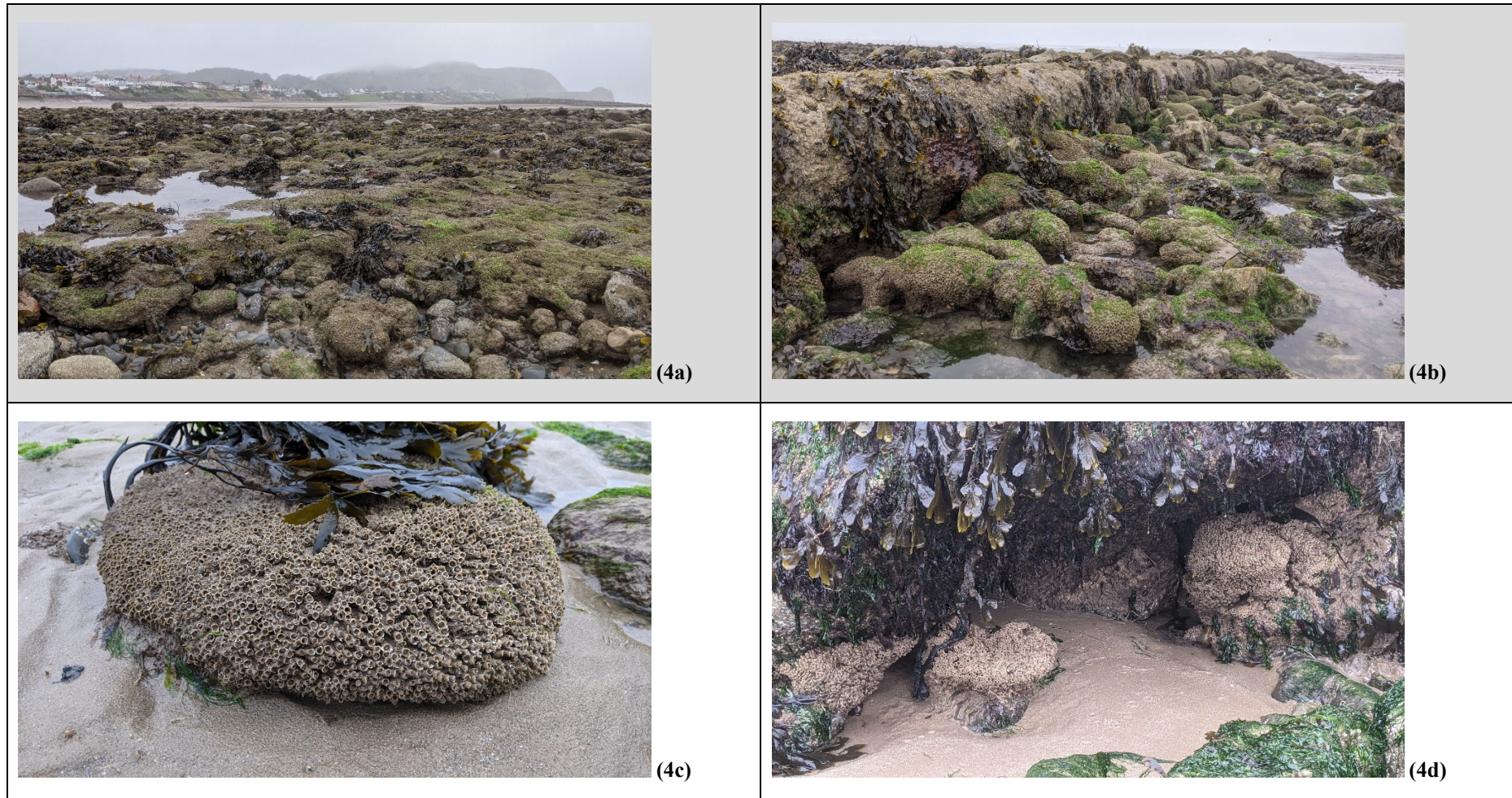
Figure 4: Higher Quality Sabellaria alveolata aggregations eastwards. Top Left: Eastern Boulder Area adjacent to pipeline. Top Right: Quality colonies in lee of pipeline. Bottom Left: Encrusted Boulder. Bottom Right: Aggregations in Eastern Breakwater rock armour.