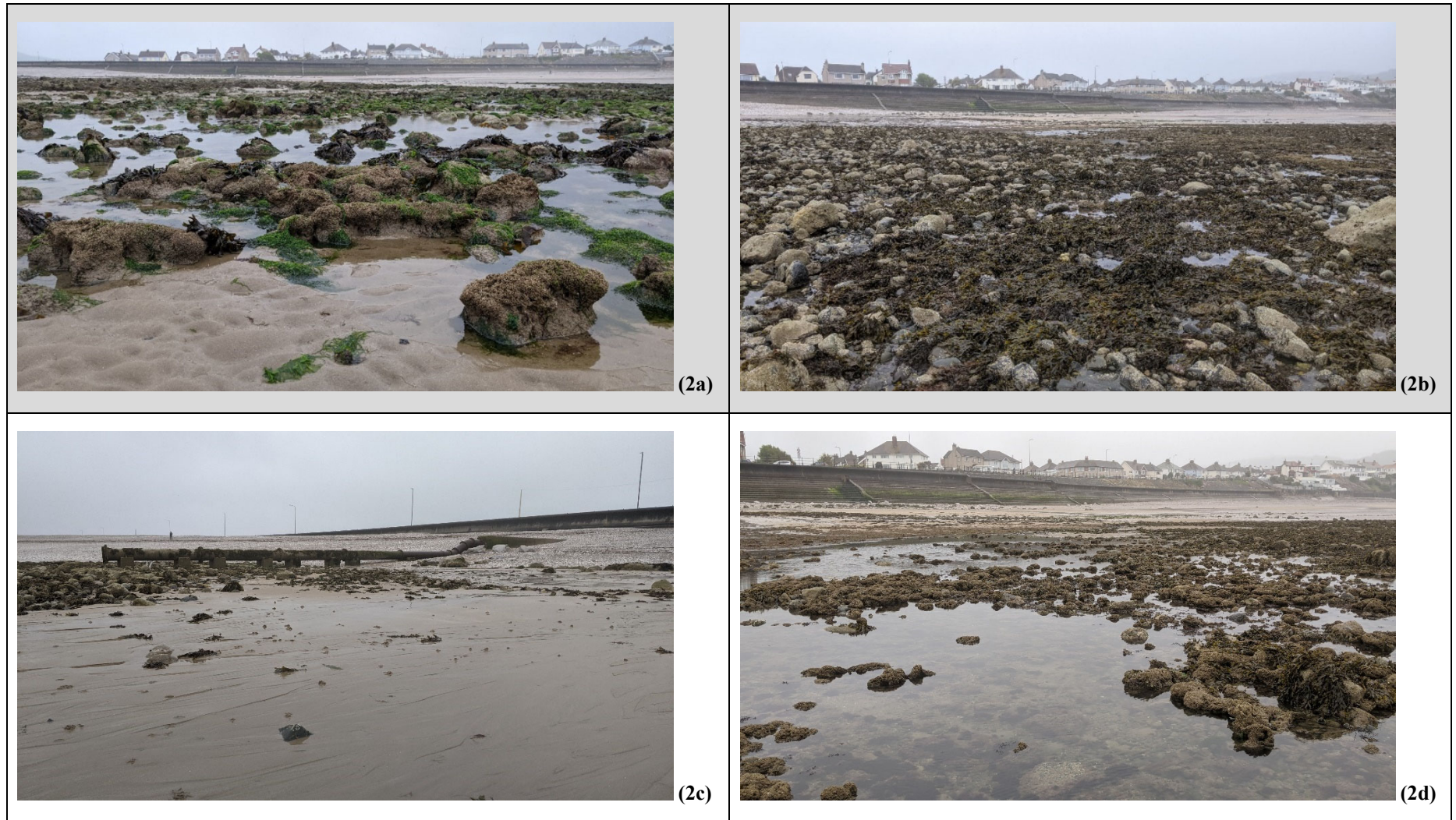
Figure 2: Top Left: Intertidal boulder habitat with Sabellaria ; beyond groyne footprint, view south. Top Right: Intertidal Boulder habitat; main area of groyne encroachment (not foreground), largely devoid of Sabellaria except for narrow band north to south. Bottom Left: Sewerage Pipeline / Outfall. Bottom Right: Eastern extent of rock groyne.