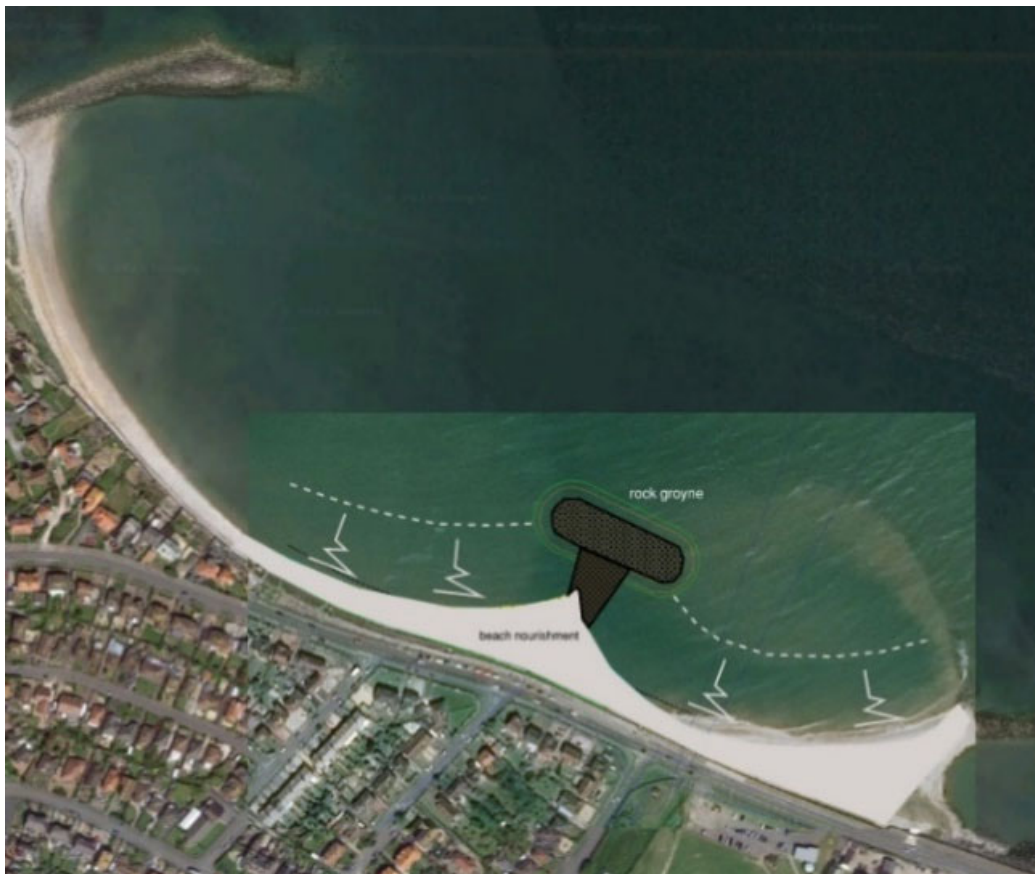
Figure 1a – Plan of Proposed Works (High Tide)

The minimum beach width is 10m, the crest level is between +5mODN and +6mODN, to be confirmed, and the beach nourishment slope is proposed at (V:H) 1:8. These design parameters are discussed further in the following sections of the report. Figure 1 shows an indicative plan of the proposed works in Penrhyn Bay at a high tide (Figure 1a) and outline at low tide (Figure 1b).