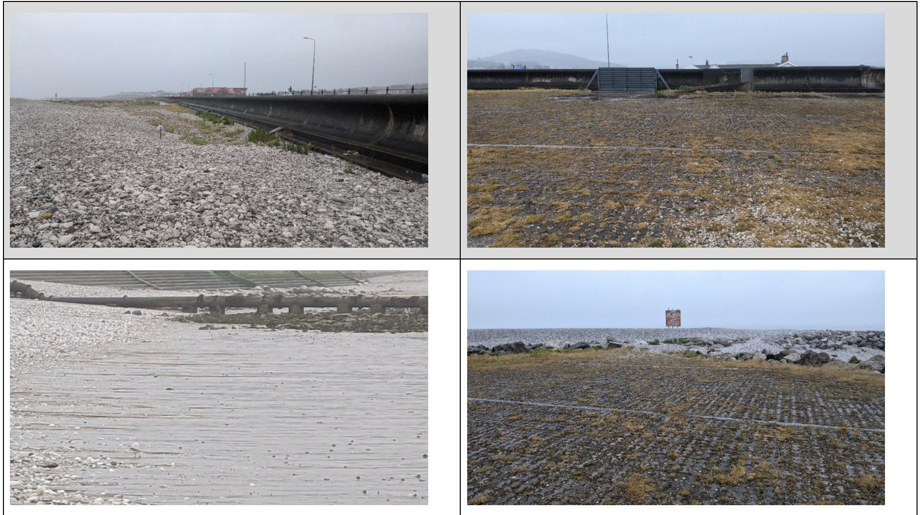
Figure 5: Top Left: Important Bird Area – Breeding Ringed Plover. Bottom Left: Ringed Plover Foraging. Top Right: Main access via Glan-y-Mor Road / Marine Drive. Bottom Right: Likely construction access route to beach.