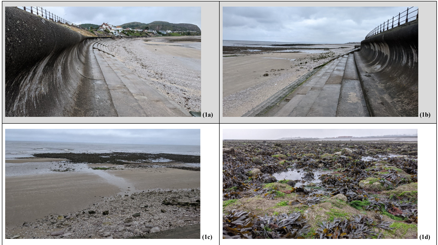
Figure 1: Top Left: Sea defence and wave return wall; view west. Top Right: Sea defence and wave return wall; view east. Bottom Left: Core scheme area, boulder habitat (darker habitat) seaward. Bottom Right: Intertidal boulder habitat with Sabellaria crust; beyond groyne footprint, view east.