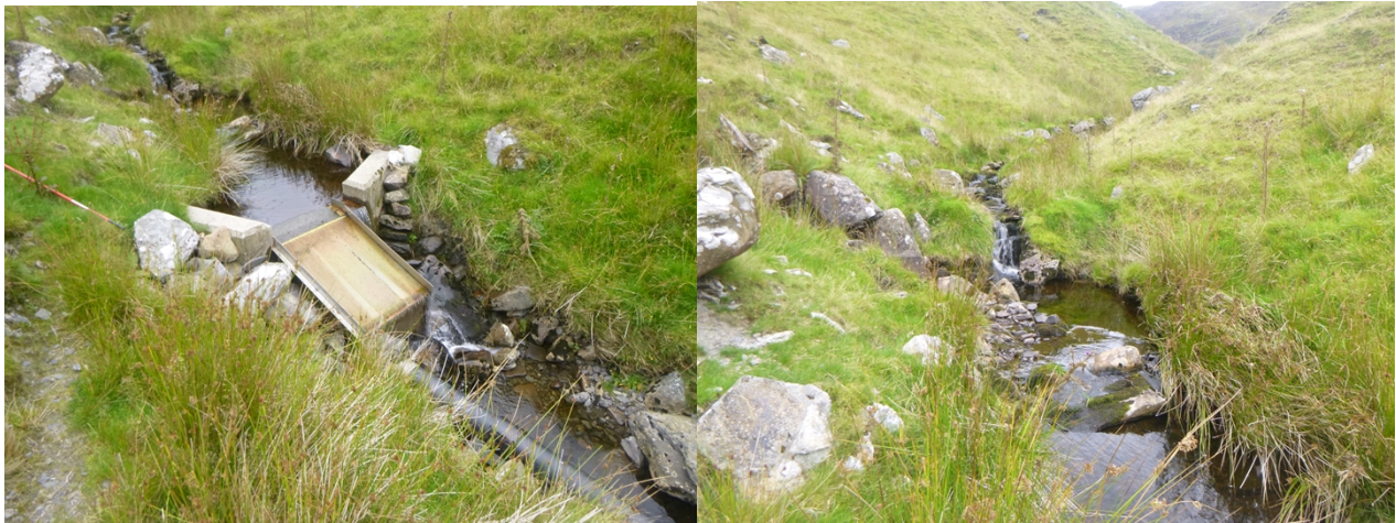
Figure 1: Abstraction point at Nant Cwm-Du. Figure 2: Downstream view from abstraction point