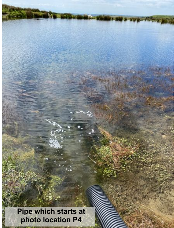
Pipe which starts at photo location P4