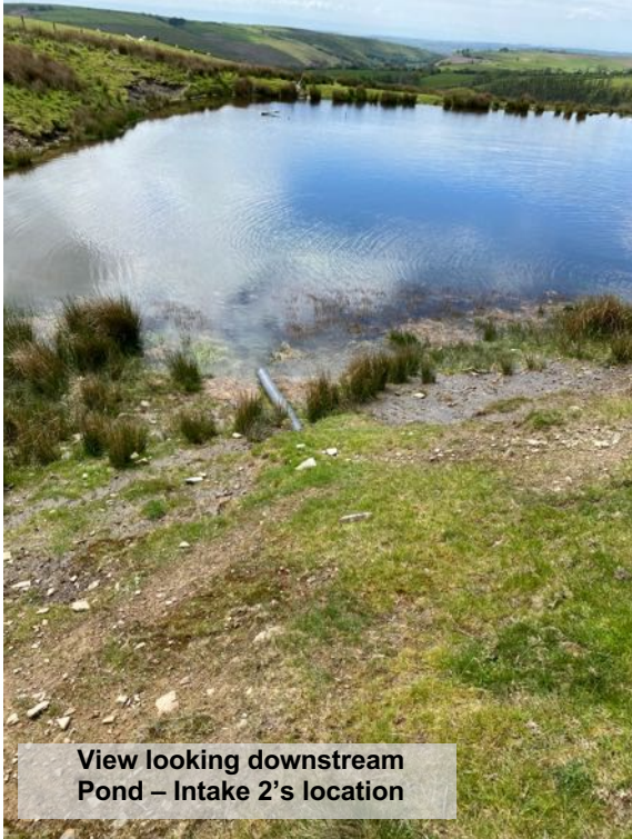
View looking downstream Pond – Intake 2's location