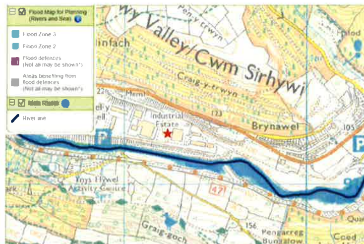
Figure 4.4.1: Flood Map