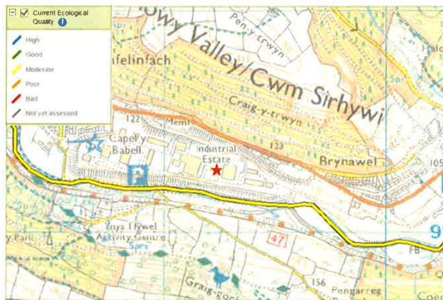
Figure 4.4.4: Ecological Quality

Image obtained from EA's 'What's in your backyard?' database. Site location is indicated with a red star