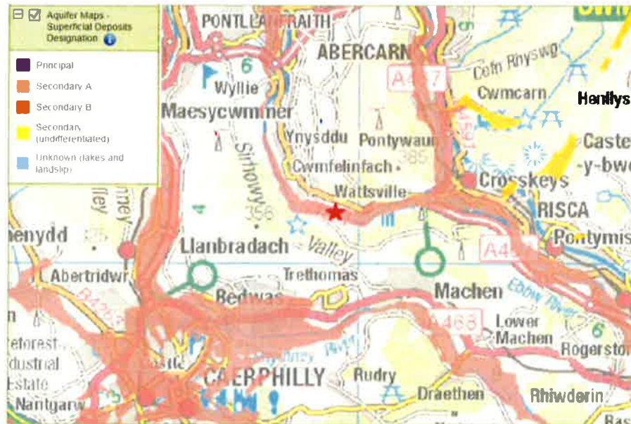
Figure 4.3.1A: Superficial Deposits Aquifer Map

The site location is indicated with a red star.