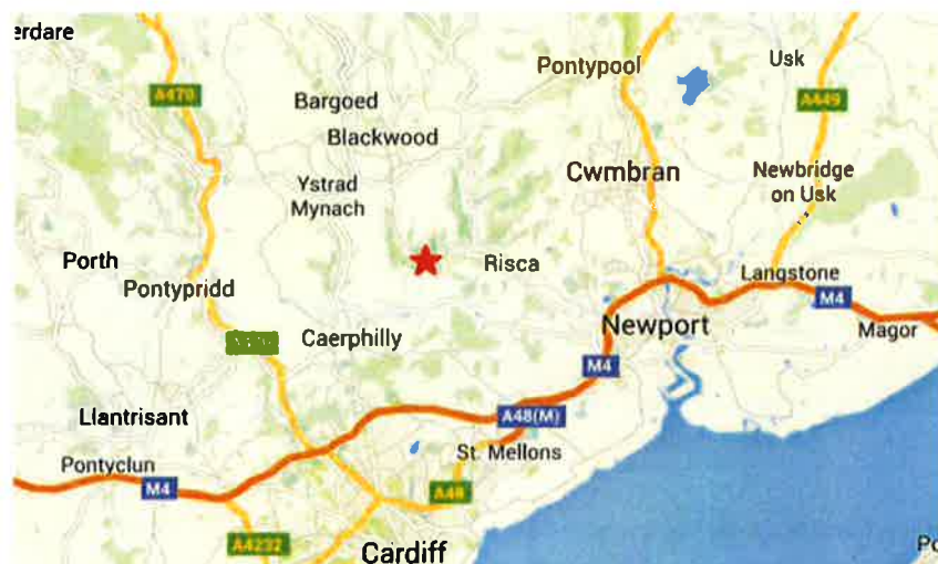
Figure 1.3.1: Site Location

Nine Mile Point Industrial Estate Ynysddu Cwmfelinfach Caerphilly South Wales NP11 7HZ