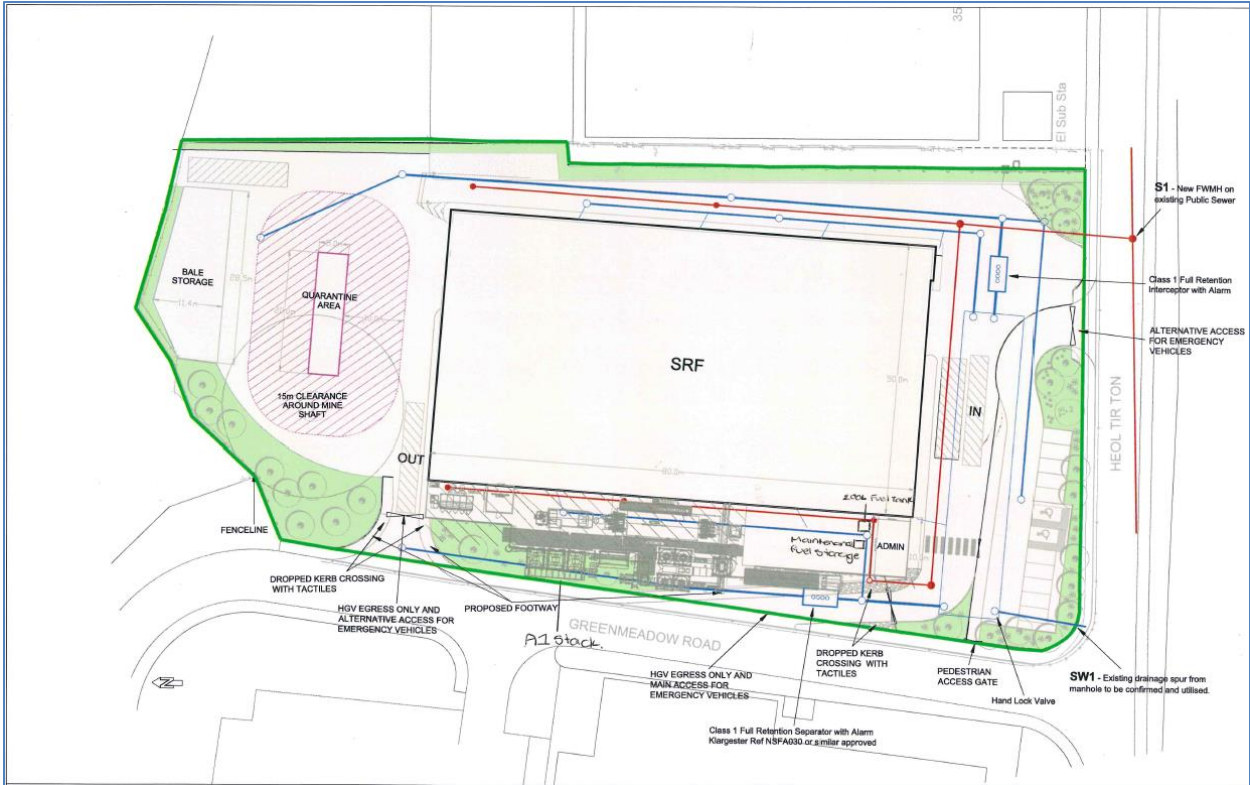
Figure 1: Site Layout