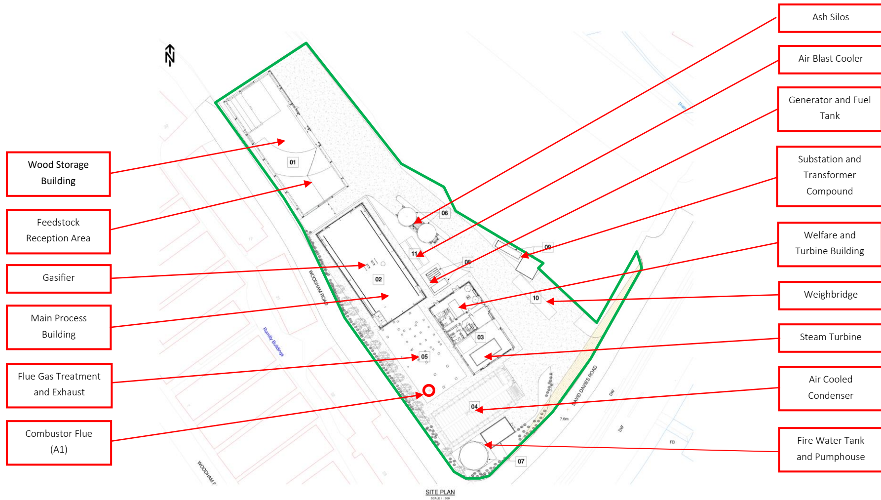
Figure 1.2: Site Plan Showing the Installation Boundary and Key Process Locations