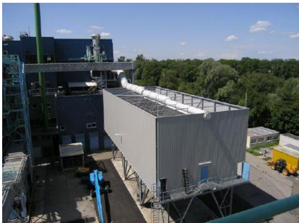
Figure 3.2 Air Cooled Condenser

The steam will be distributed to a steam distribution header located on top of the ACC.