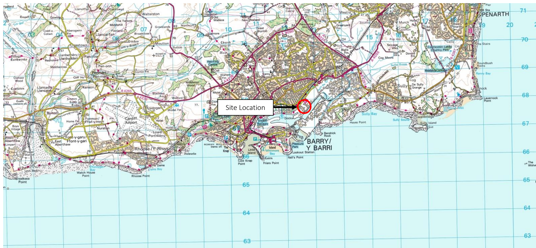
Figure 1.1: Site Location