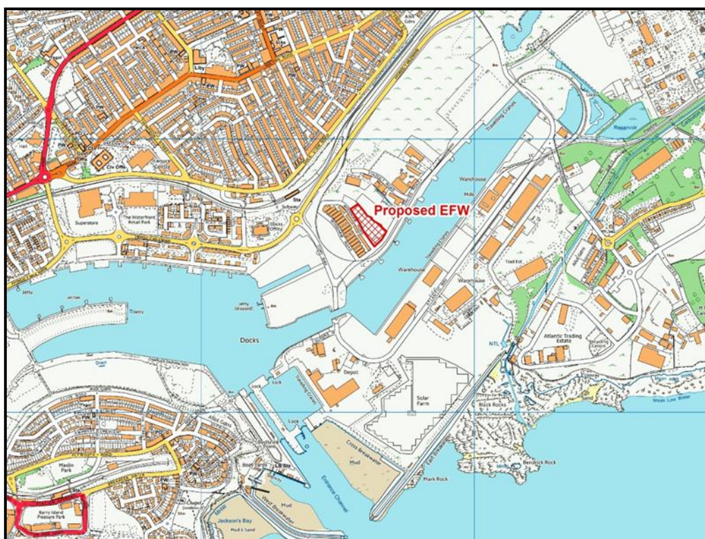
Figure 1.1: Location of the Proposed Facility