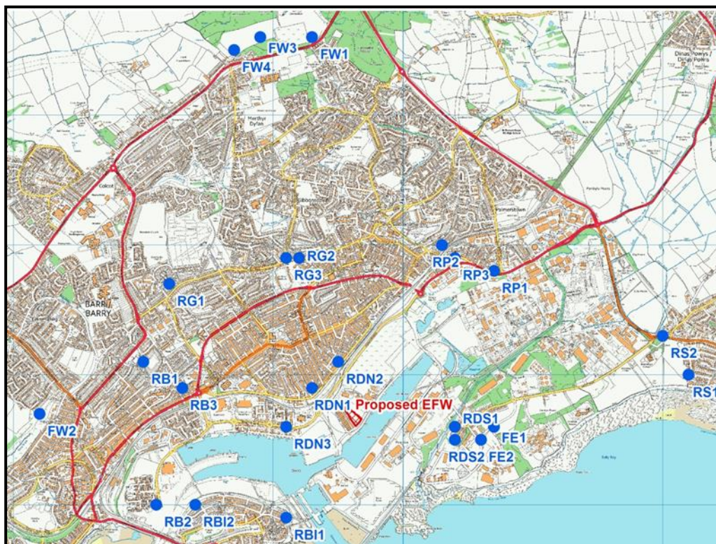
Figure 4.1: Location of the Resident and Farmer Receptors

Crown copyright, All rights reserved. 2016 License number 0100031673