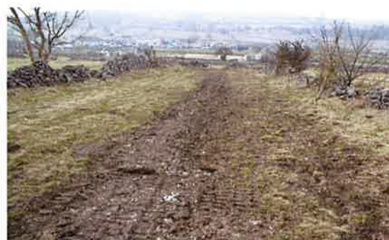
Native Derbyshire Grassland damaged during cable laying