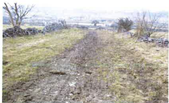
Native Derbyshire Grassland damaged during cable laying