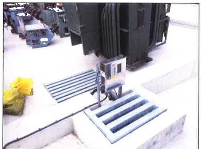
Photograph 2: Used network equipment store and pump system