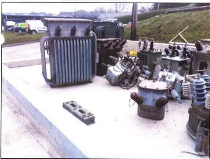
Photograph 1: Bundled former equipment store