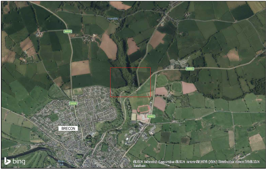
MAPS - PLAN VIEW 1:25000