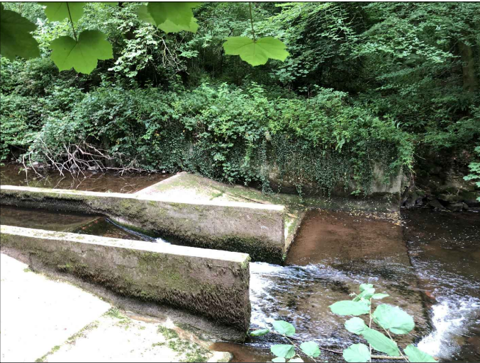
PHOTOGRAPH 1: HONDDU WEIR LOOKING TOWARDS EASTERN BANK