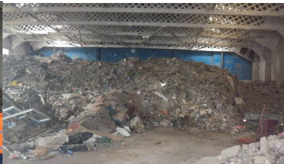
6 th July 2015