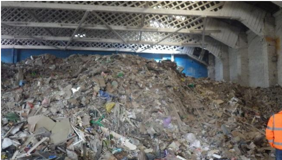
10 th June 2015

Photographs comparing today's visit with the visit back on the 10 th June 2015.