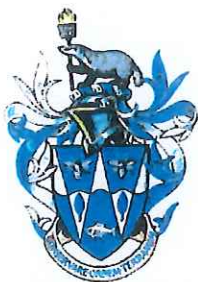
CIWM Chief Executive Officer

The Chartered Institution of Wastes Management