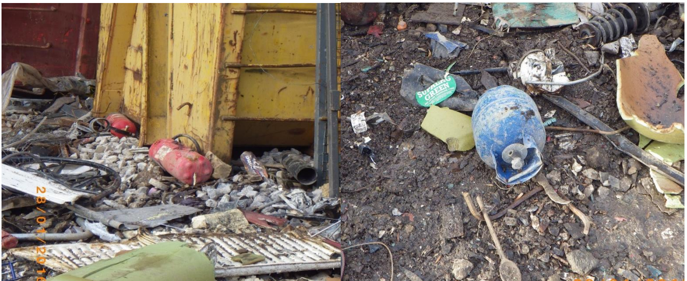
Non-permitted waste types on site

A gas canister and two fire extinguishers were seen deposited around the metal processing area. A CCS Cat 3 score has been allocated as pressurised canisters are not a permitted waste type under Schedule 2 of the site's environmental permit. Currently there is no quarantine skip present on site. We require that all non-permitted waste is transferred to a quarantine skip immediately after discovery.