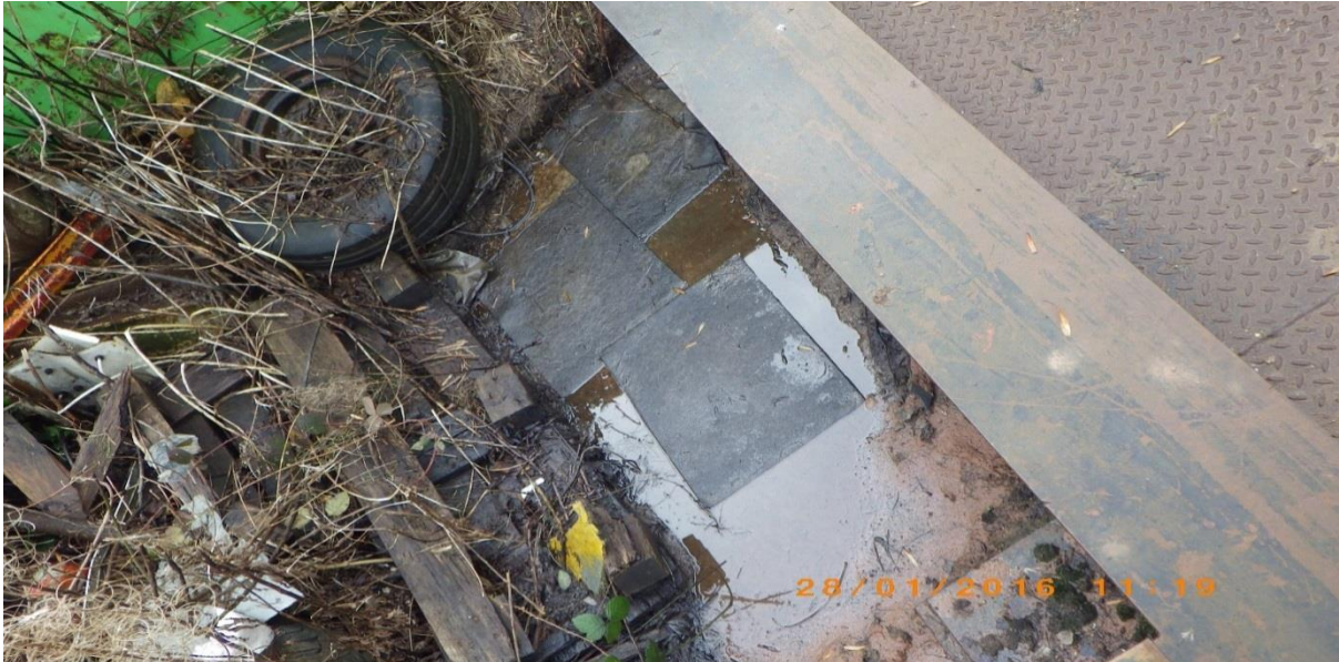
Oil contamination around the site weighbridge

A gas canister and two fire extinguishers were seen deposited around the metal processing area. A CCS Cat 3 score has been allocated as pressurised canisters are not a permitted waste type under Schedule 2 of the site's environmental permit. Currently there is no quarantine skip present on site. We require that all non-permitted waste is transferred to a quarantine skip immediately after discovery.