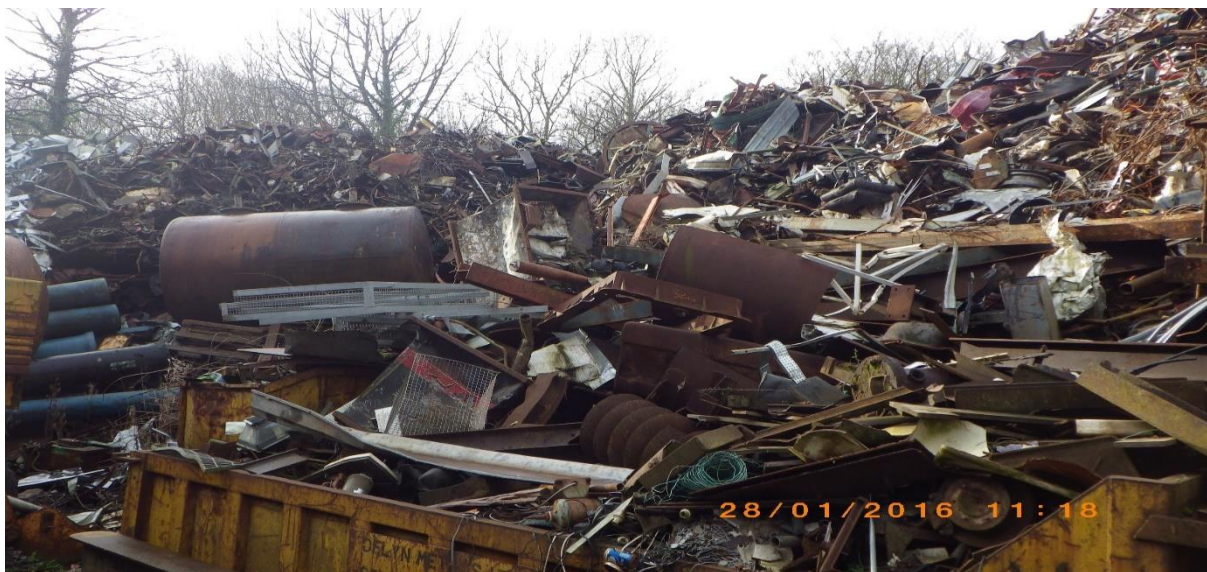
A cross-section of the waste metal stockpiles on site

Concerns were raised relating to the stockpiles of ferrous metals stored on site. The stockpiles are of substantial size and the recorded quantities of scrap metal are estimated to be around the 8000 tonne limit outlined in the sites environmental management system (EMS). In addition to the recorded quantities of metal there is also a large unknown quantity of historic scrap that was imported to site prior to Stuart Butterworth becoming the site manager. The total quantity of scrap metal is therefore very hard to calculate. Due to the quantities of scrap metal significantly exceeding the 8000 tonnes a CCS Cat 4 score has been allocated on this occasion. Given the current downturn in the price of scrap metal, it is understood that it is not currently as lucrative to export the metal from site. However, compliance relating to the site license should not diminish and we request that work is begun to reduce the quantities of metal on site.