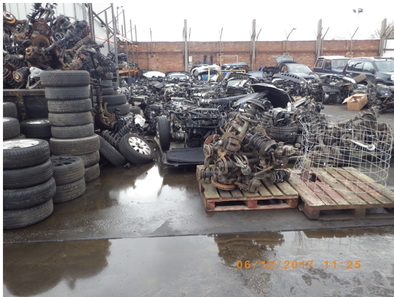
Various vehicle parts stored outside

There were a number of engines and car parts that were stored outside (see photo below). As in accordance with Table 4.4 of the site permit (and section 4.8.5.3 of site EMS), these were all segregated by type and stored on impermeable concrete ground which drained to the site interceptor. However these parts are also required to be stored in 'dedicated appropriate containers that are fit for purpose', it would be advantageous to look into acquiring suitable containers for these vehicle parts or to look into construction of covering for them to stop the impact of rainwater both on the parts and washing oils/fluids from them - this was shown by the standing water near the parts which had a mild oil sheen on it.