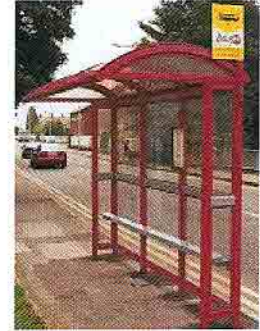
TYPICAL IMAGE OF SHELTER.

NOTE: 'ARUN' CANTILEVER SHELTER. (To Be Erected Over Feeder Conveyor/Hopper).