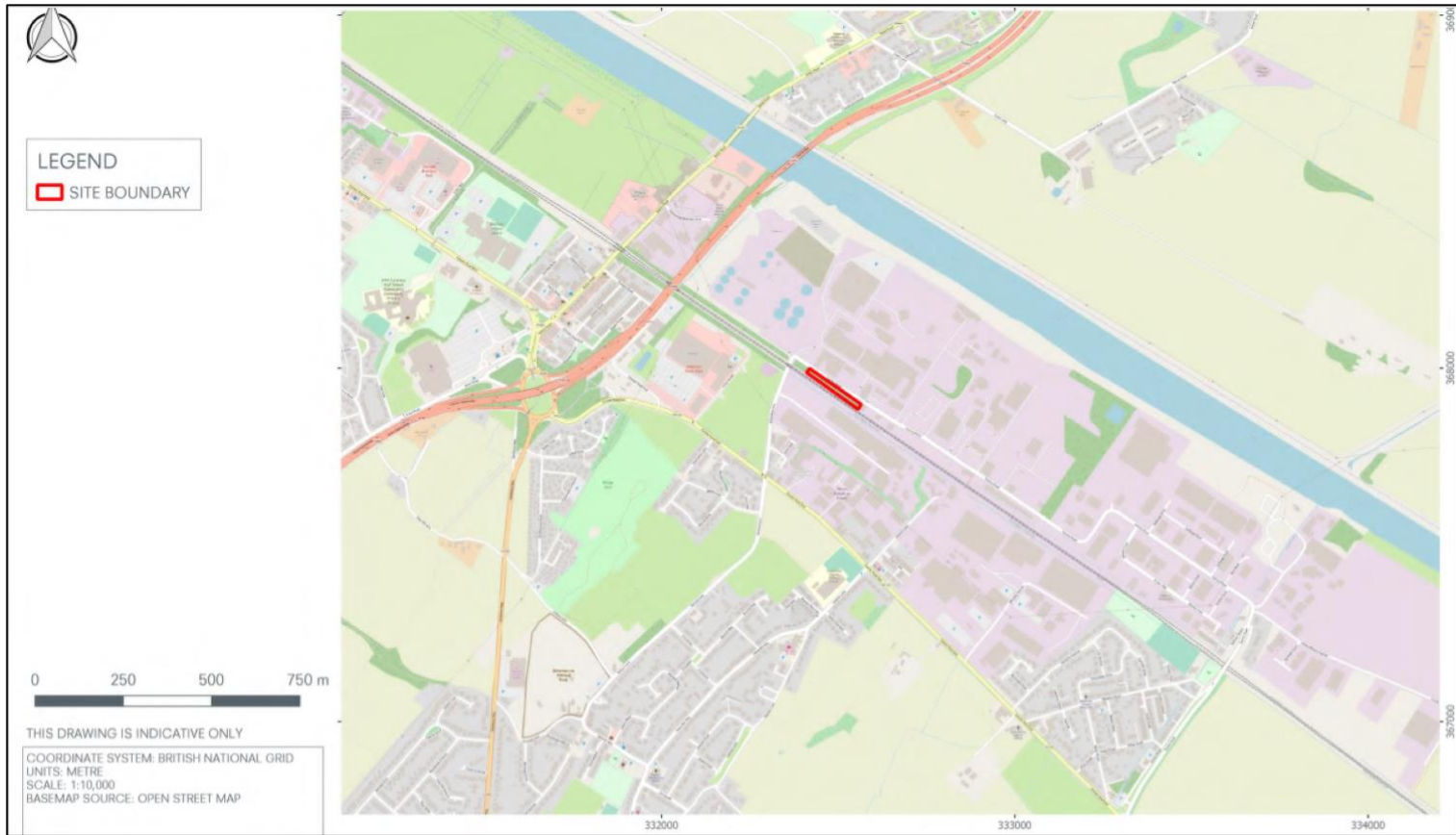
Site location map