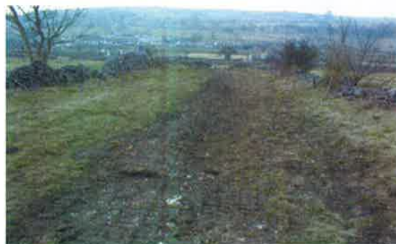
Native Derbyshire Grassland damaged during cable laying