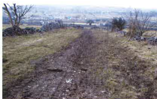
Native Derbyshire Grassland damaged during cable laying