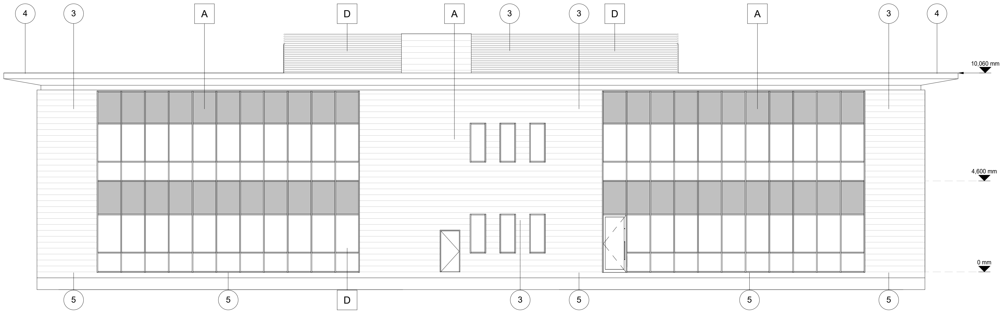
South West Facing Elevation Scale @ 1 : 100