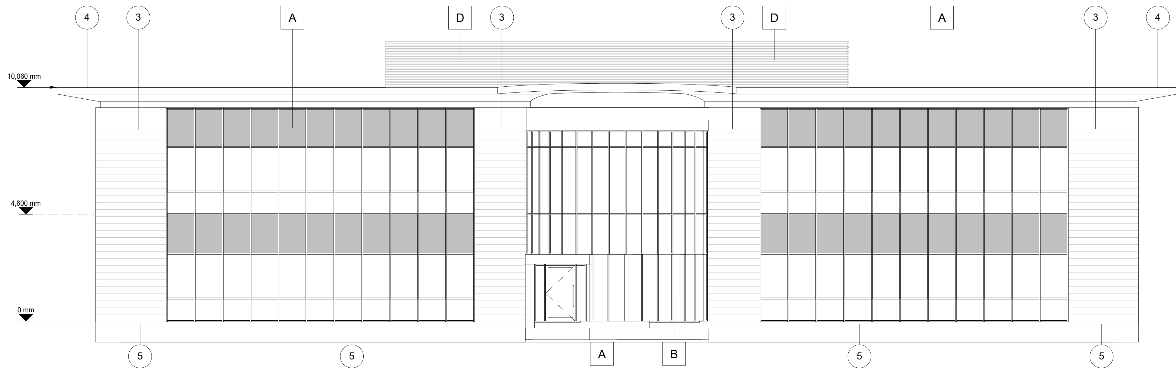
North East Facing Elevation Scale @ 1 : 100