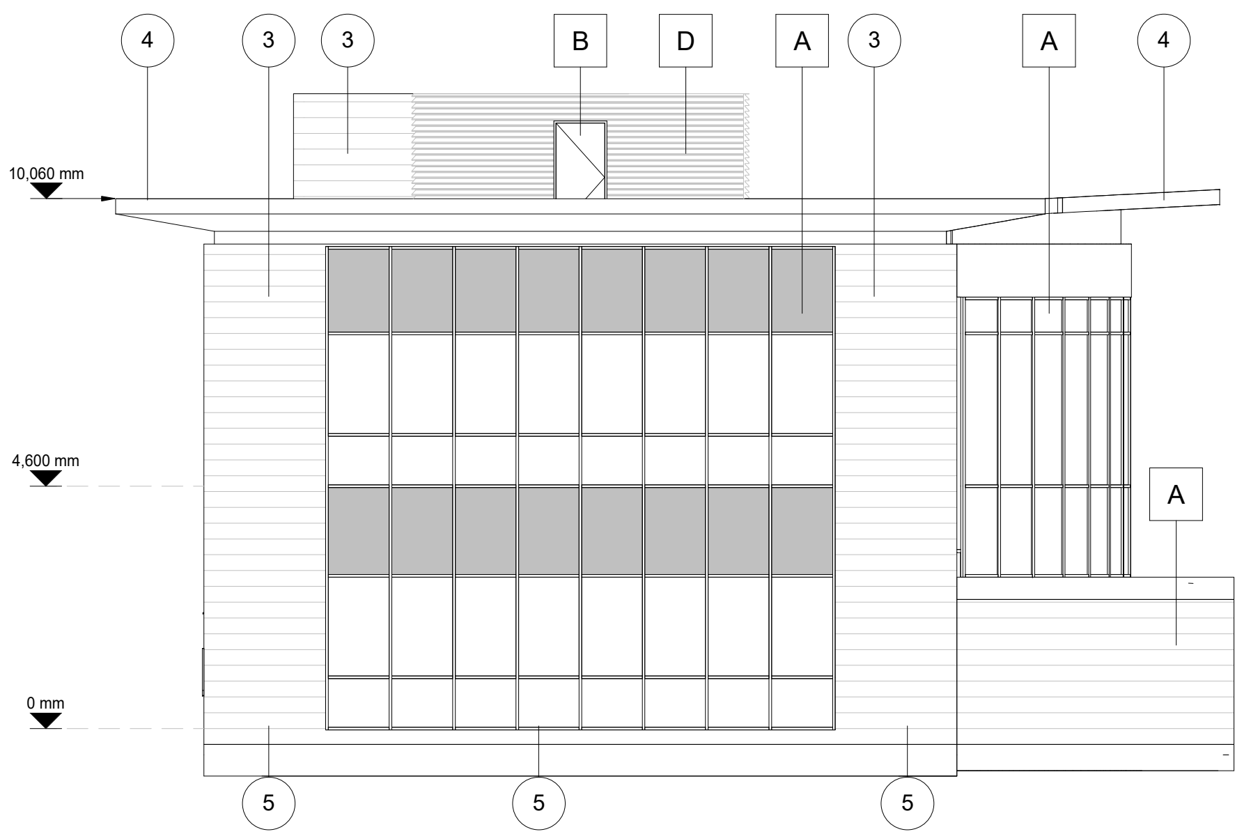
South East Facing Elevation Scale @ 1 : 100