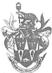
CIWM Chief Executive Officer

The Chartered Institution of Wastes Management