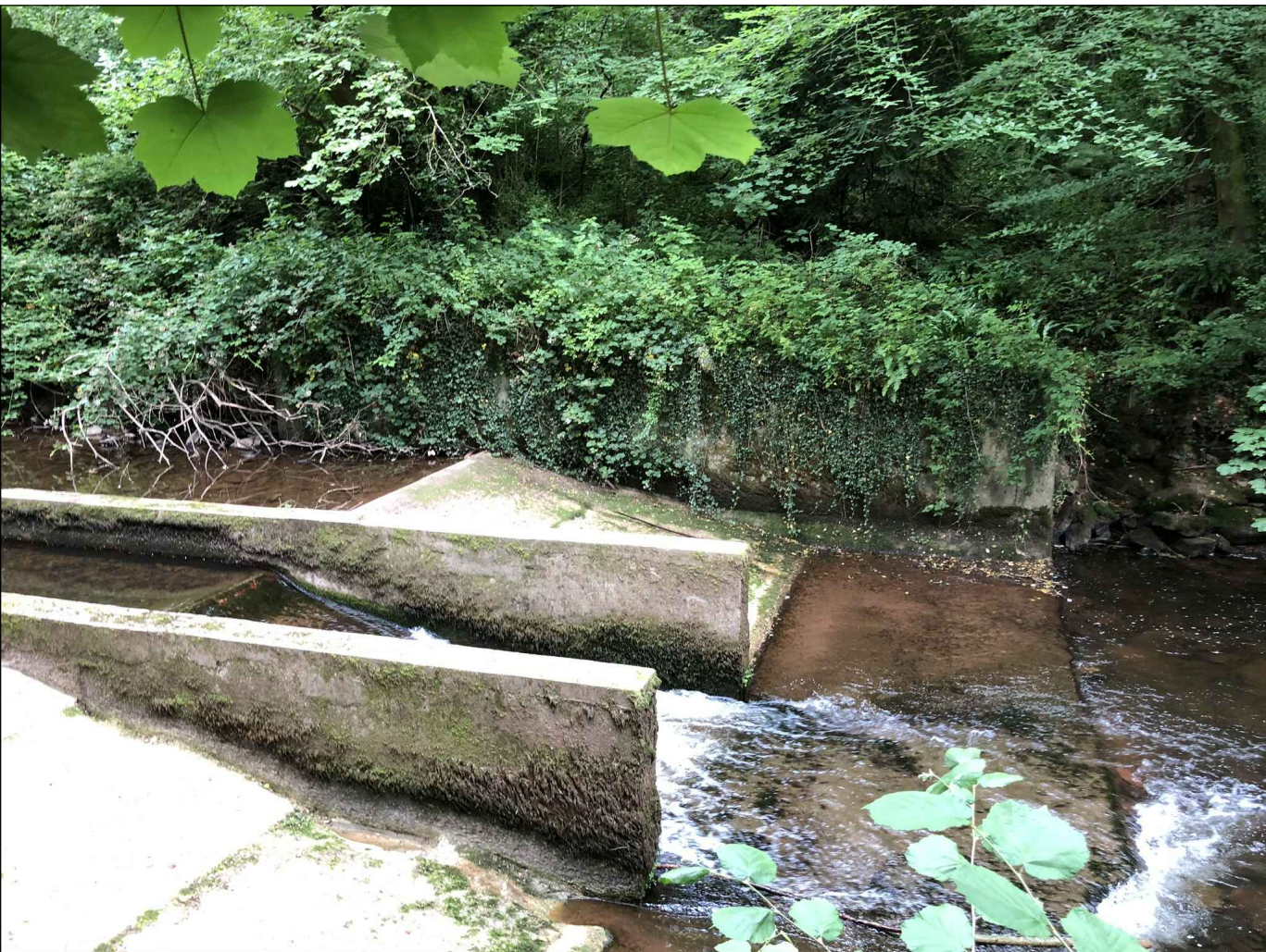
PHOTOGRAPH 1: HONDDU WEIR LOOKING TOWARDS EASTERN BANK (ARUP, JULY 2020)