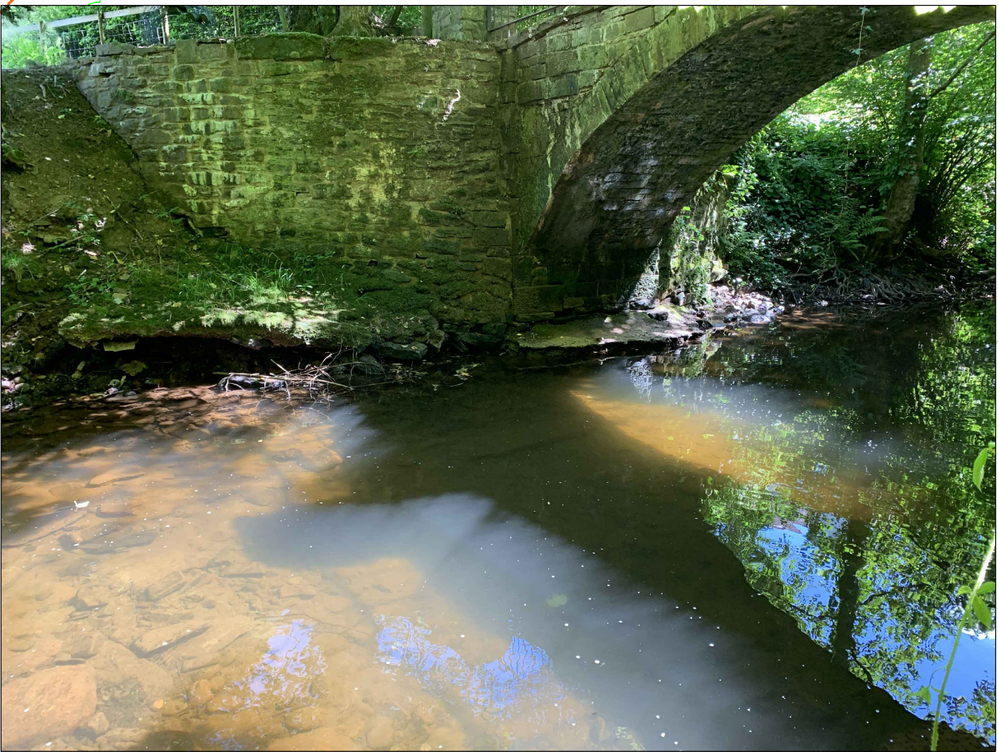
PHOTOGRAPH 1 - SCOUR PROTECTION TO BE REPAIRED