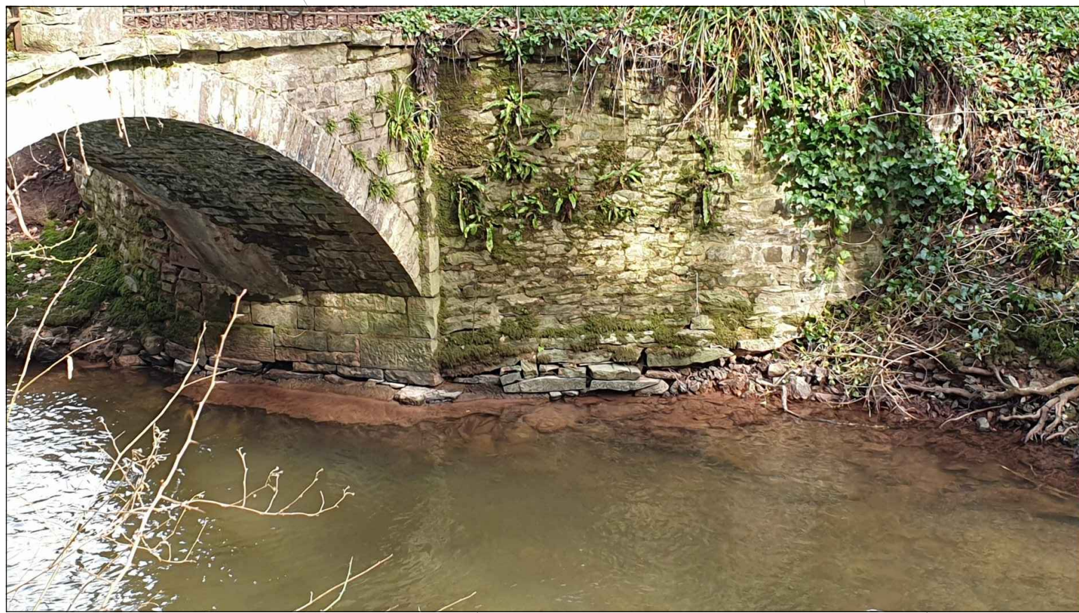
PHOTOGRAPH 2 - TYPICAL AREA FOR REPOINTING ON WEST BANK

REPOINTING TO BRIDGE ABUTMENTS WHERE EXISTING MORTAR HAS BEEN WASHED OUT ASSUME FIRST 2 COURSES OF BRICKWORK FOR 20m FOR PRICING PURPOSES. SEE PHOTOGRAPH 2