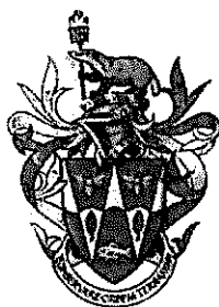
CIWM Chief Executive Officer

The Chartered Institution of Wastes Management