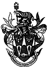
CIWM Chief Executive Officer

The Chartered Institution of Wastes Management